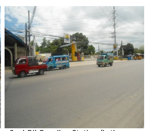
Seal Oil Gasoline Station (is the property in front)