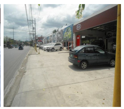
Picture taken facing Cebu City at the front left side of the property.