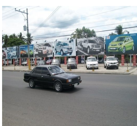
Kia Office a Display Area and Service Area at the back